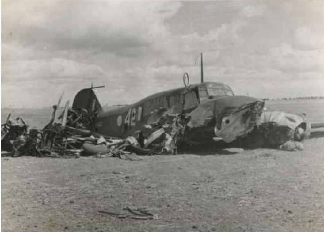
AX642 of 2AOS which crashed at Yellangip, Vic, on 9 th March 1944 ('casualty 1 sheep, 1 unborn lamb'). This was one of the wireless-equipped Ansons received in December 1943 – note the Direction Finding loop.

The new courses were eventually designated as 'Navigator Wireless' training, and were longer and more complex than the previous courses. The trainees would now spend over six months with 2AOS (up to 32 weeks) and did a higher amount of night flying as well as the wireless instruction. One of the effects was a much higher failure rate, often in excess of 50% (although in most cases those trainees could re-enrol). As a result the number of trainees passing out each month fell to between 24 and 49 during 1944. The net effect of these changes was a drop in the total amount of flying hours per month. For example, 1,497 hours of day flying were flown in June 1944, while the equivalent number often exceeded 3,000 hours in 1943.