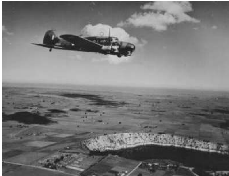
2AOS Anson flying over the Blue Lake, Mount Gambier.