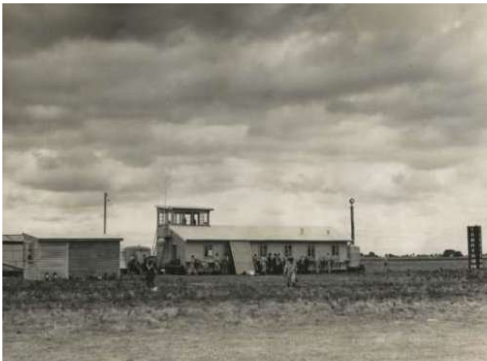
Airfield building at 2AOS dispersal area, 1944.

In October 1943 2AOS flew a record of 3,356 hours of day flying and 549 hours of night flying. However this probably reflected some catch-up after winter conditions had limited flying in previous months. It amounted to almost 60 hours of flying per trainee. While most exercises were flown in the vicinity of Mount Gambier, extended training flights were flown to other RAAF bases including Deniliquin, Mildura, Parkes, Parafield, Port Pirie and Uranquinty.