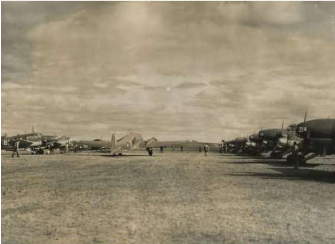
2AOS dispersal area in September 1944, not long before the 'flap' of 9 th December 1944.