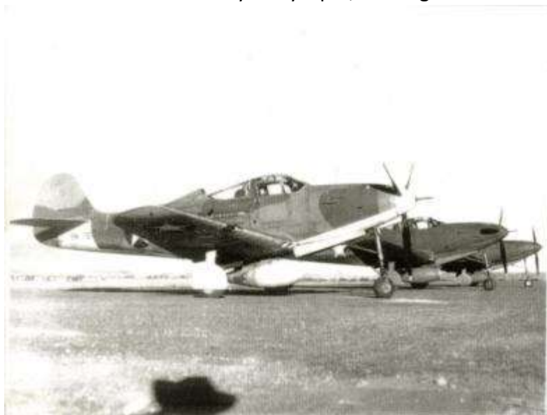
A photo of USAAC P-39s/P-400s held for many years by the South Australian Aviation Museum. It was very possibly taken at Mount Gambier. The nearest aircraft is BW179, which was allocated to the 35 th PG on 14 th March.

Here the Americans received their first Bell P-39F Airacobra fighters (some were P-400s: a P-39 variant intended for the RAF). Also joining the group were some veteran personnel: 8 pilots and 16 enlisted men who had served in Java. However, the Americans had left by early April, moving to bases in NSW and Queensland. A